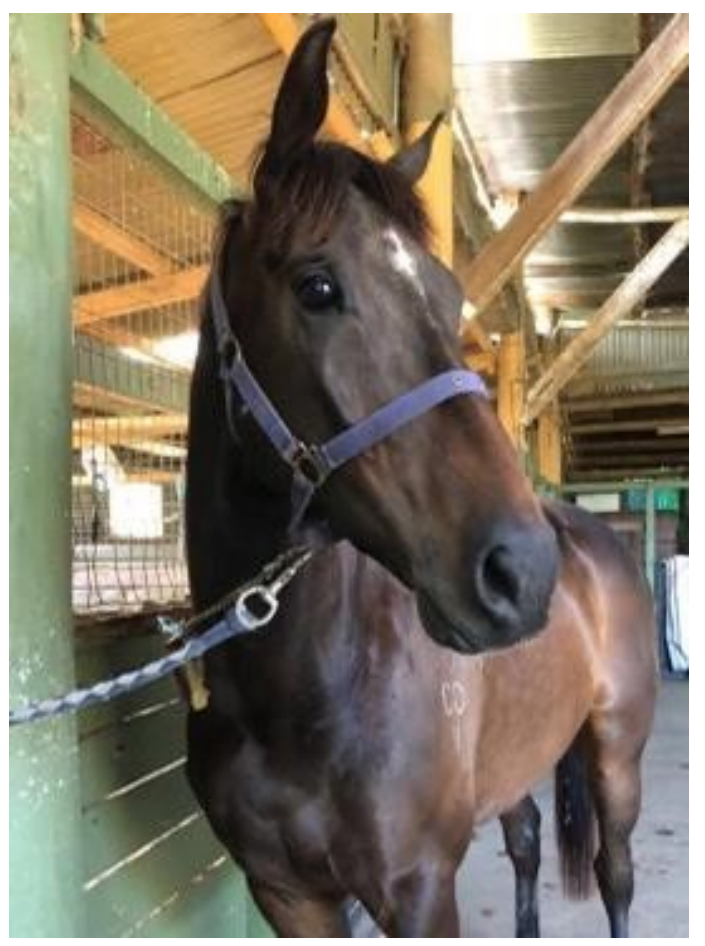
Legistation looking happy about going out on grass for a couple of weeks