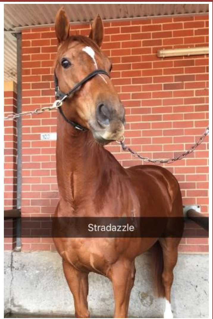
Stradazzle looks keen to get on with the job AND HE DID!

We look forward to OUR ANNIVERSAIR, BANJO'S VOICE a lovely All-American filly, (un-named) and NIGHTLY GRINDE, all moving forward this month of August.