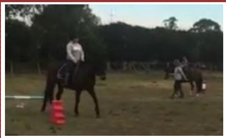
Saturday afternoon at Wicky Wacky Farm. Click here to watch video.

STARDAZZLE, after consoling with his stable mate KS, set out to show her how with maturity a race horse possesses the strength to find the line. And that he did, by running his usual Bernborough style, into a close third over 1800mts. He was then on track and ready for a true staying test.