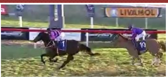
Wow Wow Wow !!!! Hawkesbury 5th July. 3 wins in a row for Super little horse Legistation!!

LEGISTATION on the same day – same place, was racing for a hat trick. This was his fifth start this prep and he showed he was at his peak by WINNING over a decent field by 3 lengths! Another interesting fact. He has been ridden by a different Jockey in all of his six wins, so far?