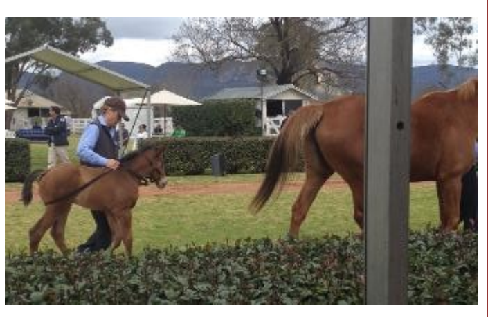
At Widden Stud, we were delighted to see 'Your Songs' first foal, only two days old --What a beauty!

TOO CHIC raced again on the 21<sup>st</sup> at Hawkesbury over 1500mts. She settled well in a truly run race (which she needs) and rattled home like the honest little darling that she is, unfortunately being held up for fifty meters or so in the straight, ment she missed out on the win but she ran a very close third. We were more than pleased with her run and also how she pulled up so Chic has a chance to win again this prep, which will make it three wins in one prep!!