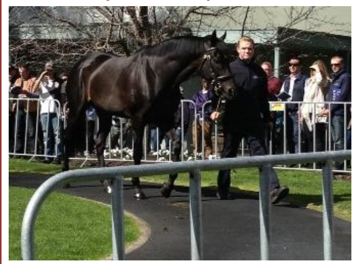
This horse is "So You Think", I say--- so you think--- you want to send your mare to him, well think again unless you have one hundred and twenty thousand dollars to spare !!!