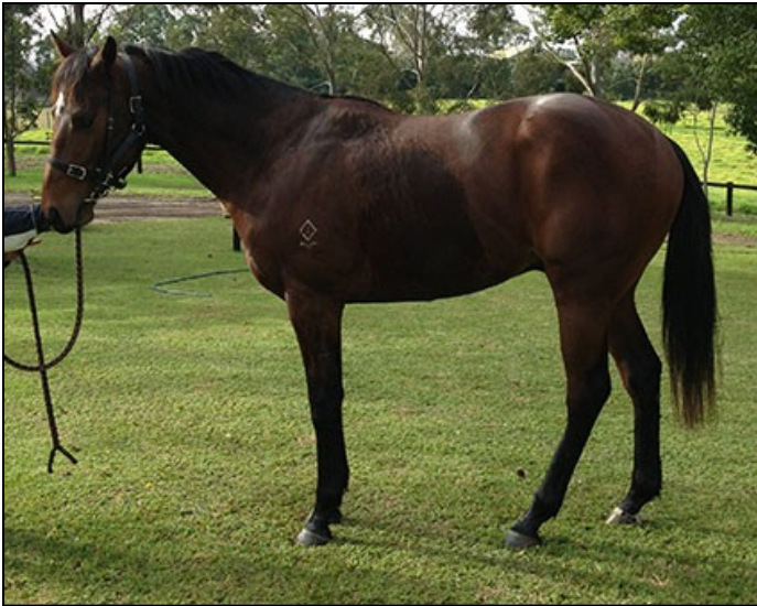
Shares are still available for this lovely colt by Trotomondo