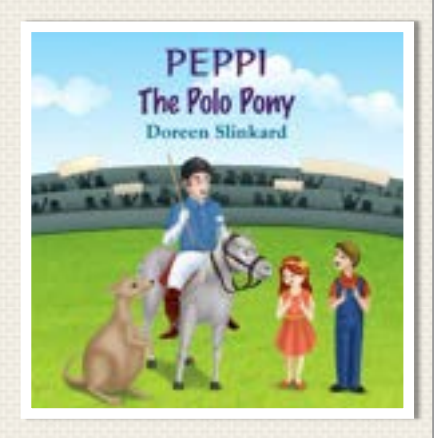
PEPPI THE POLO PONY