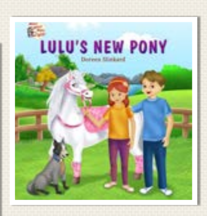
LULU'S NEW PONY