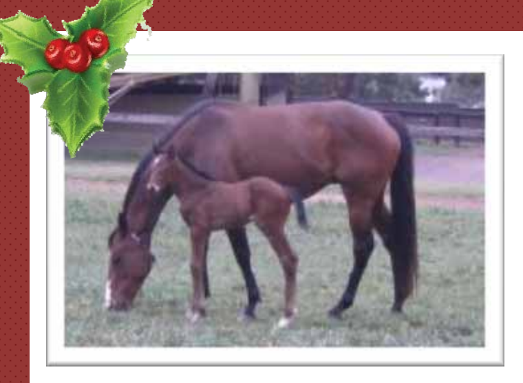
If my mum's name is Rose, I must be a Rose bud filly

HAMBERG raced at Canterbury on the 21<sup>st</sup> over 1550, with the journey being a little too long. He did however run a great race only beaten a little less than two lengths. We have come to the conclusion that 1400 is his distance. We have had several 1400mt specialists, most of whom showed us a staying quality that soon fizzled out when put over a longer distance, but when put back to the 1400, they excelled again.