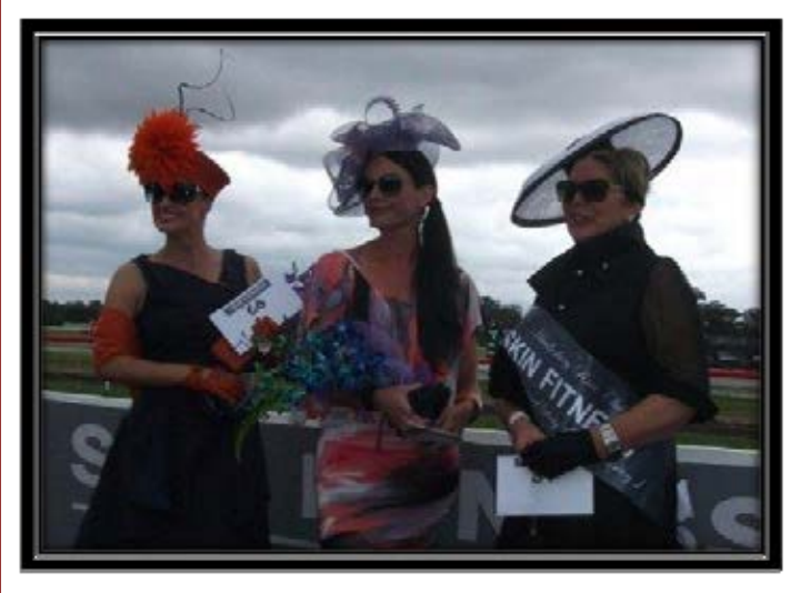
Contemporary Best Dressed

That was Tuesday..... come Thursday; even more enjoyment came our way with HAMBERG backing up from a fabulous 2<sup>nd</sup> at Rose hill on the previous Saturday to show them a clean pair of heels to win the Ted McCabe Memorial trophy race at Hawkesbury. As he was passing the post, I was being sashed the winner in the contemporary best dressed. With even more excitement , being sashed by one of the calendar firemen! Hot stuff, they nearly had to extinguish me after the kiss.