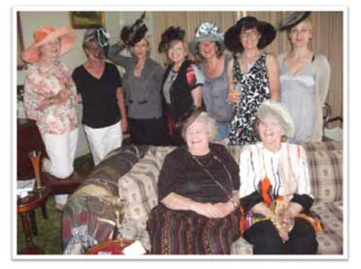
Melbourne Cup Day at Windermere Farm