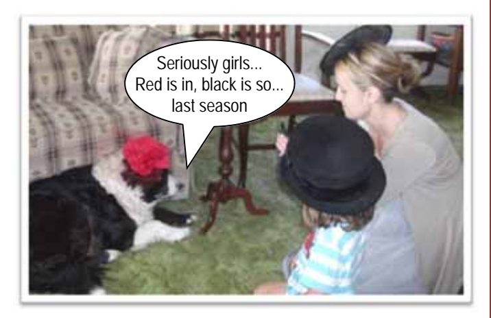
We all got into the spirit.. even Jack the dog !!!