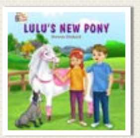
LULU'S NEW PONY