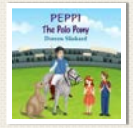
PEPPI THE POLO PONY