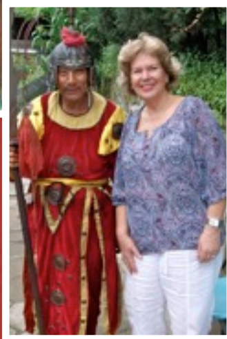
MORE PHOTO ON THE FINAL PAGE