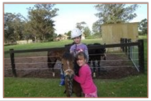
Everybody loves the new pony Bubbles. Black Pirate in the background says "everybody get back to work, that's the only way we get any cuddles around here"