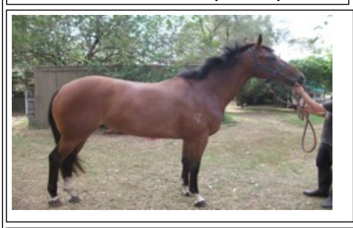
Cleo's gift- Kepinsky 2yr old filly