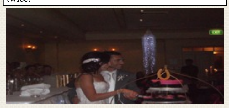
The happy couple cut the cake

Meanwhile, Swing and Sing ran a very close and unlucky fourth, Eyes Magic was ridden with speed from an outside barrier and just knocked up and poor Lady Green had no luck whatsoever, nearly falling twice.