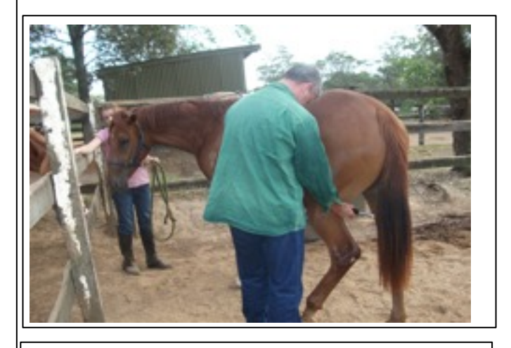
Madam Medusa , how good does that feel?