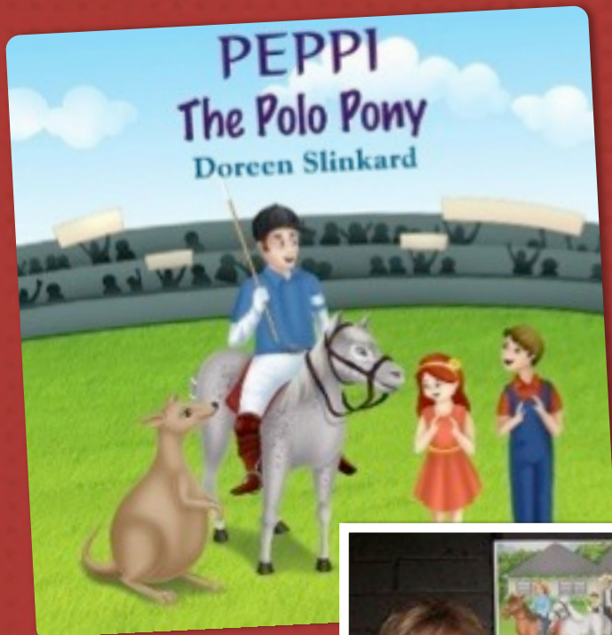
TOP: PEPPI THE POLO PONY IS SET FOR CHINA