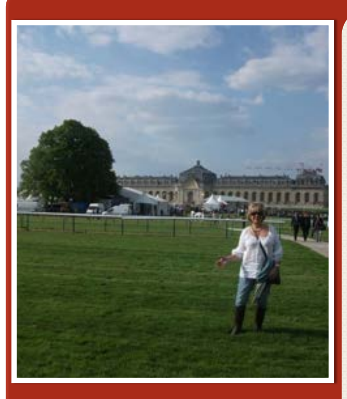
ABOVE: I'm having this turf delivered to Hawkesbury tomorow!!!!!!