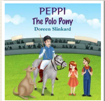
PEPPI THE POLO PONY