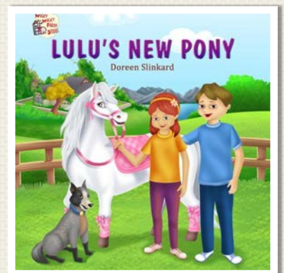
LULU'S NEW PONY