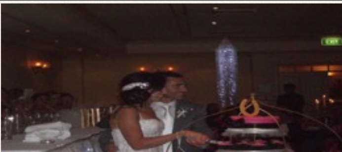
The happy couple cut the cake

Meanwhile, Swing and Sing ran a very close and unlucky fourth, Eyes Magic was ridden with speed from an outside barrier and just knocked up and poor Lady Green had no luck whatsoever, nearly falling twice.