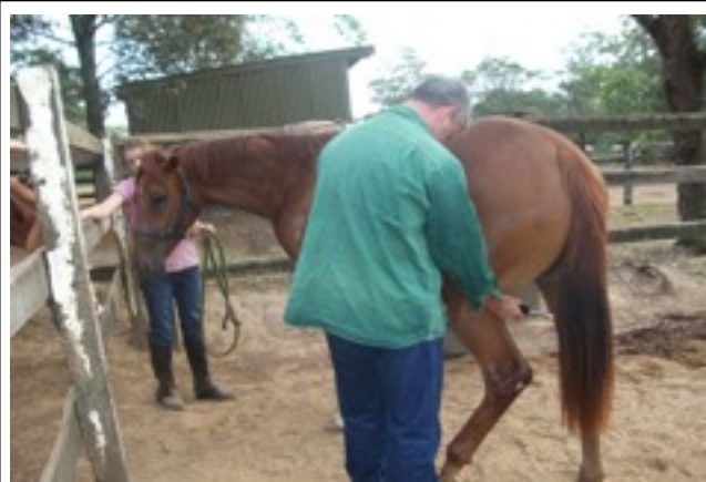
Madam Medusa , how good does that feel ?