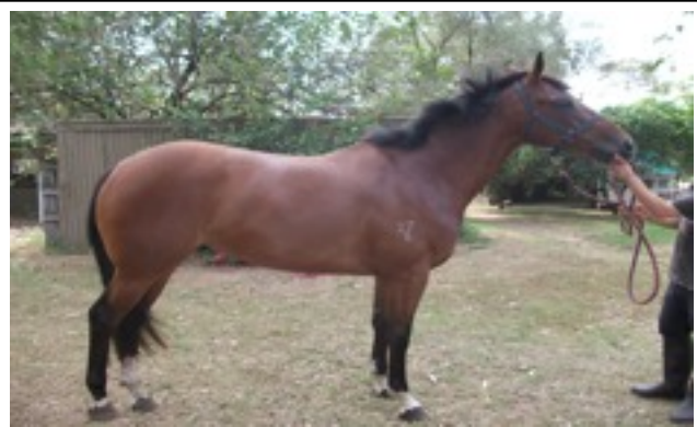
Cleo's gift - Kepinsky 2yr old filly