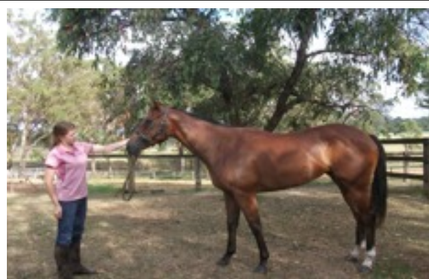
The unnamed Dane Shadow 2yr old filly